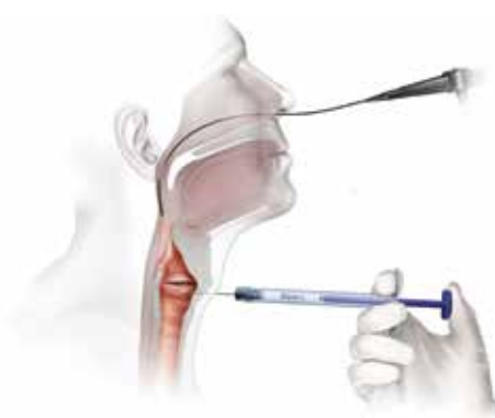
Thyroid Cartilage approach