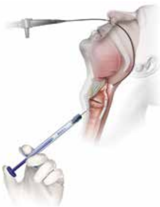
Cricothyroid Cartilage approach