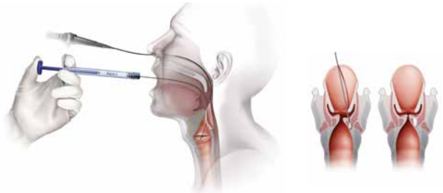
Office Based Trans-Oral Calcium Hydroxylapatite (CaHA)