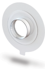
Round BE 6082