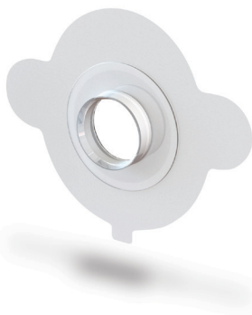
Oval BE 6083