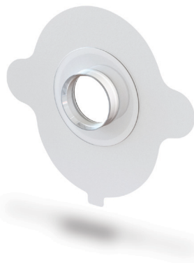
Oval Extra BE 6084